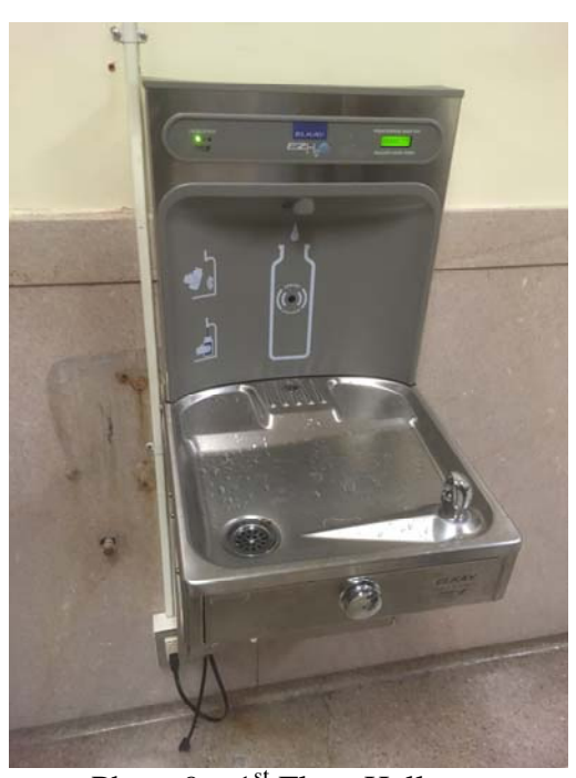
Photo 9-1^{\rm st} Floor Hallway The compressor for the hydration station was making a very loud noise and was unplugged.