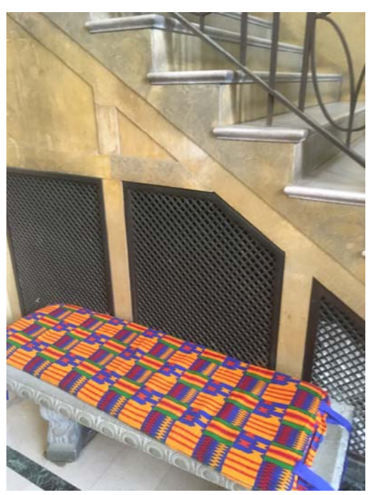
Photo 1 – Main Entrance A steam leak was observed on the east side of the main entrance.