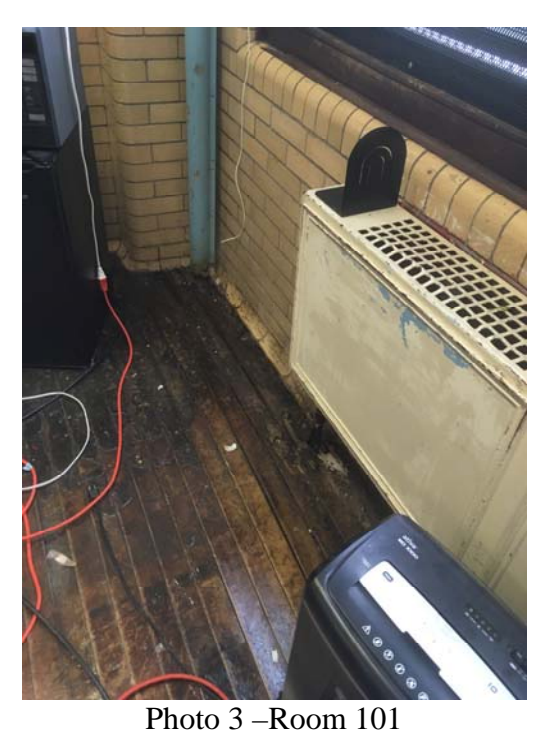
A steam leak in the crawlspace below impacted the hardwood flooring in the corner of the room.