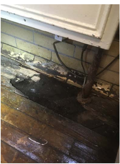
Photo 8 – Room 103 The hardwood flooring was impacted by a steam leak from this radiator.