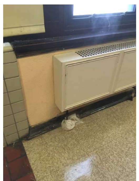
Photo 6 – Room 108 A steam leak occurred on the riser between the crawlspace and radiator.