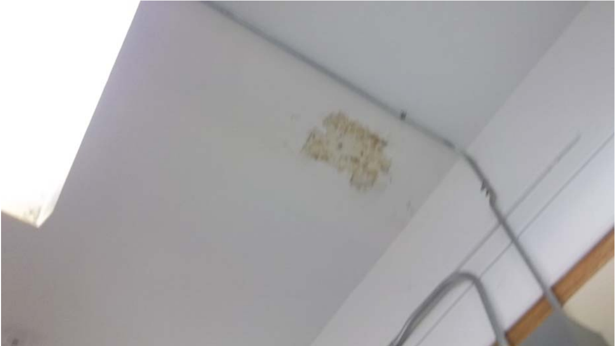
Photo 29 – Hallway outside Room 207 Flaking paint and water staining was observed on the ceiling.