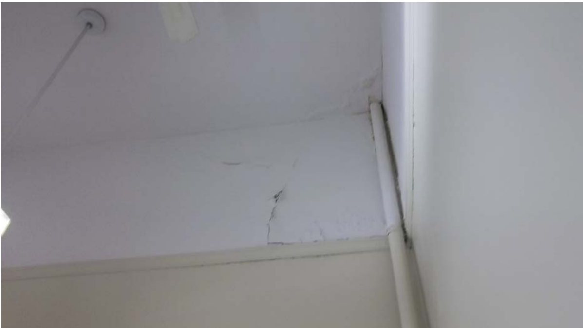
Photo 30 – Counselor's Office (2 nd floor) Moisture damaged plaster was observed on the upper wall section.