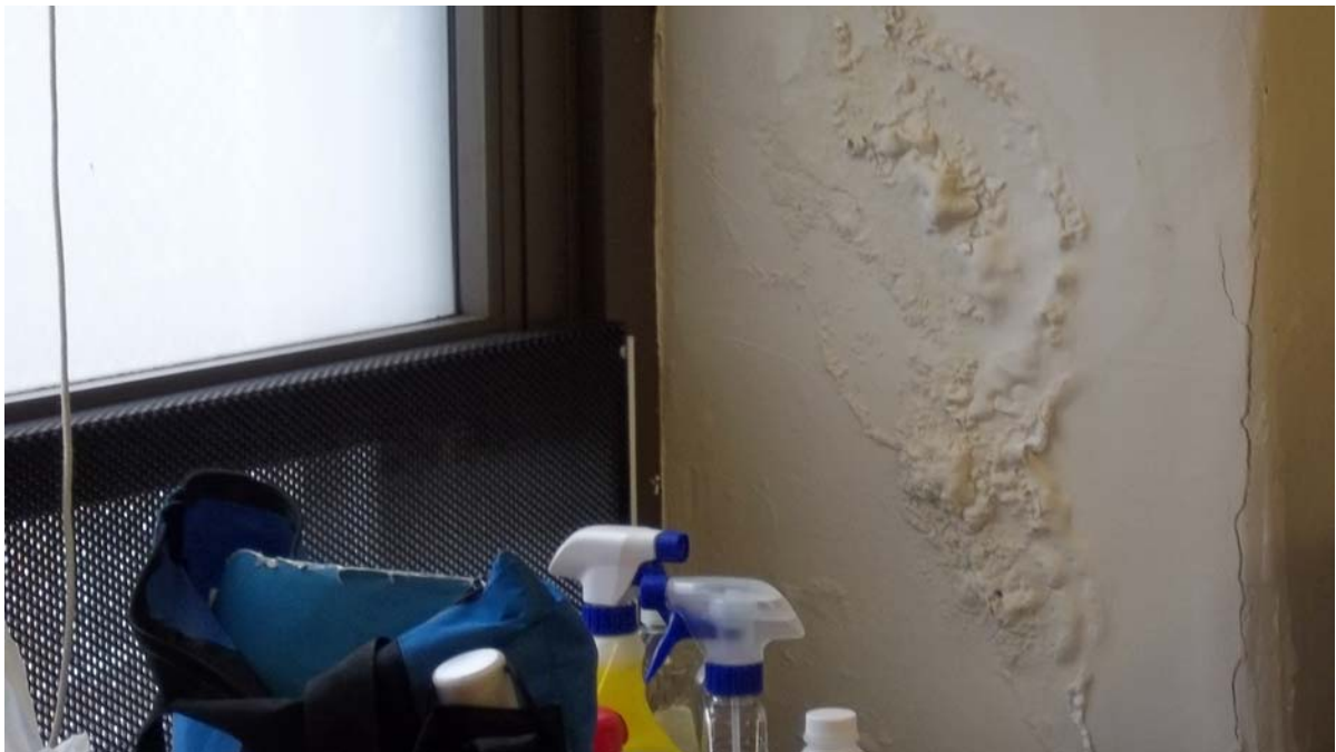
Photo 20 – Room 204 Moisture damaged paint and plaster was observed around 2 windows.