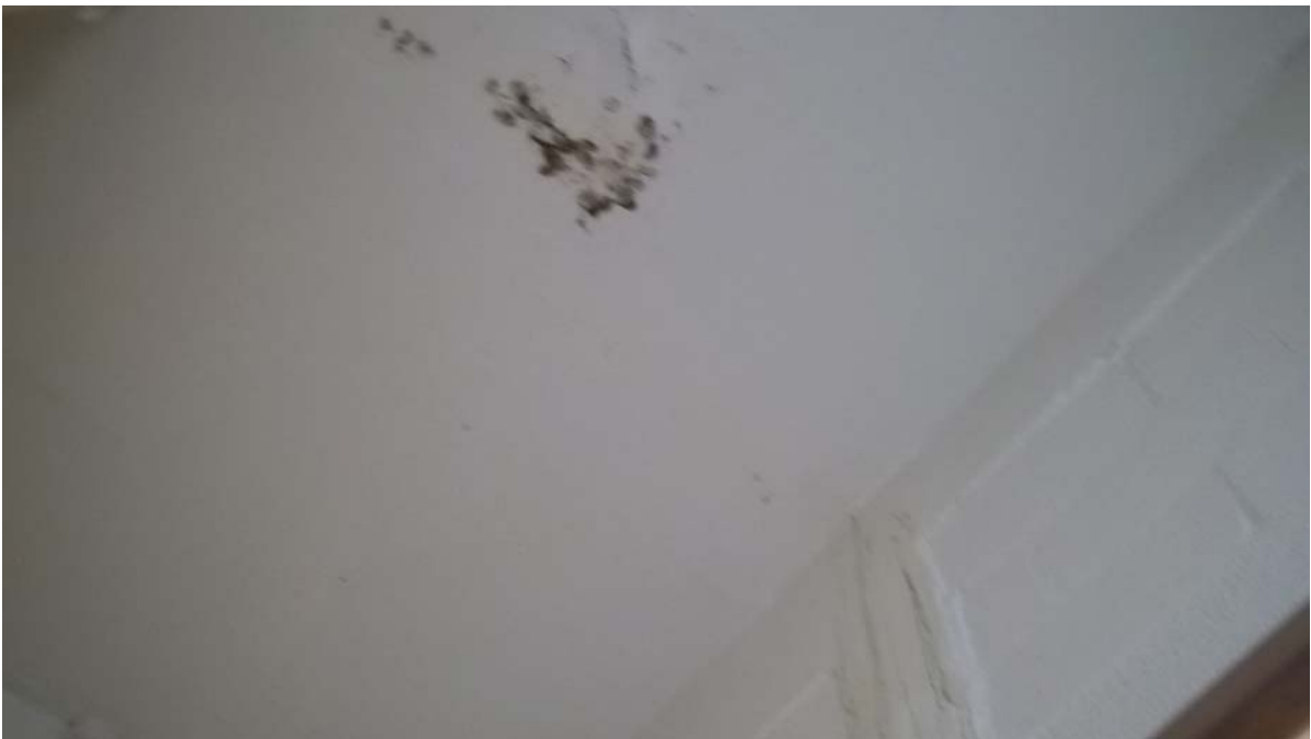
Photo 16 – Room 202 Closet Staining was observed on the ceiling from a leak that was stabilized.