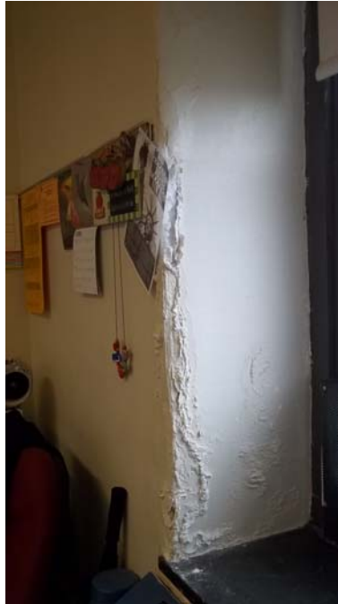
Photo 25 – Room 206 Moisture damaged paint and plaster was observed around 2 windows.