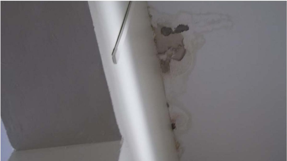
Photo 28 – Room 207 Flaking paint and water staining was observed on the ceiling from a leak that was stabilized.