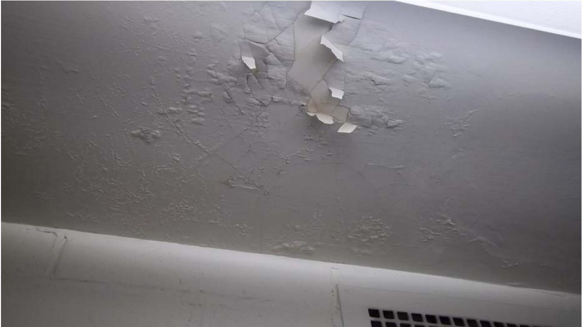
Photo 15 – Room 202 Closet Flaking paint was observed on the ceiling of the closet.