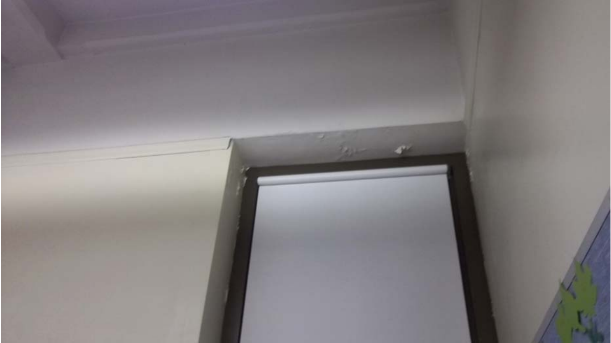
Photo 31 – Nurse's Office Flaking paint was observed above 1 window.