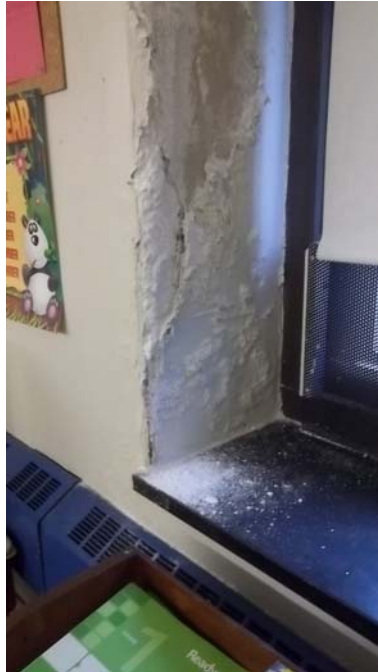
Photo 3 – Room 106 Paint and plaster debris was observed on the window sills.