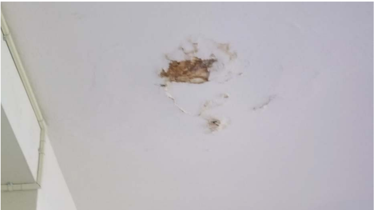
Photo 22 – Room 205 Flaking paint and staining was observed on the ceiling from a leak that was stabilized.