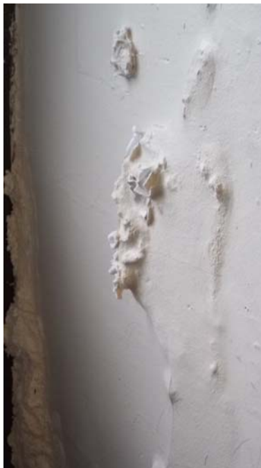
Photo 26 – Room 206 Moisture damaged paint and plaster was observed around 2 windows.