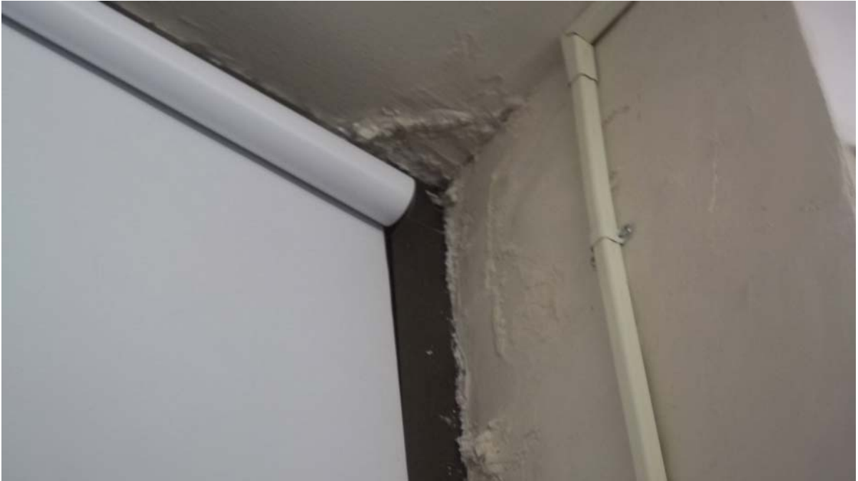
Photo 23 – Room 205 Moisture damaged paint and plaster was observed around a window.