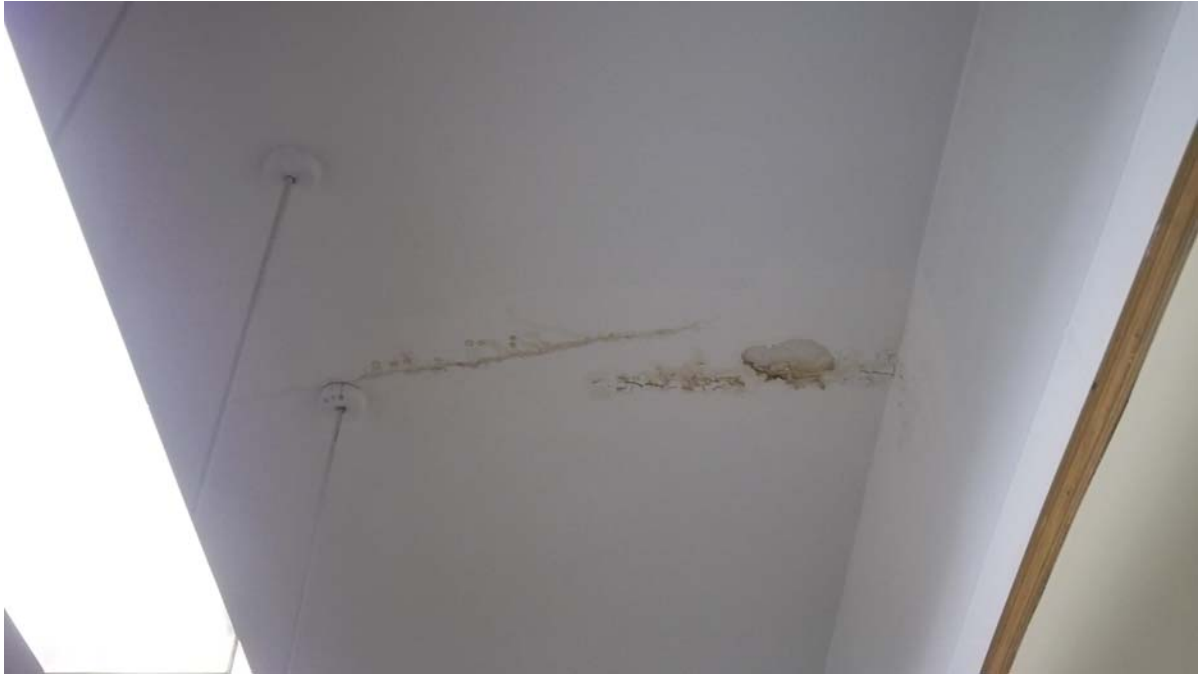
Photo 19 – Hallway outside Room 207 Flaking paint and staining was observed on the ceiling from a leak that was stabilized.