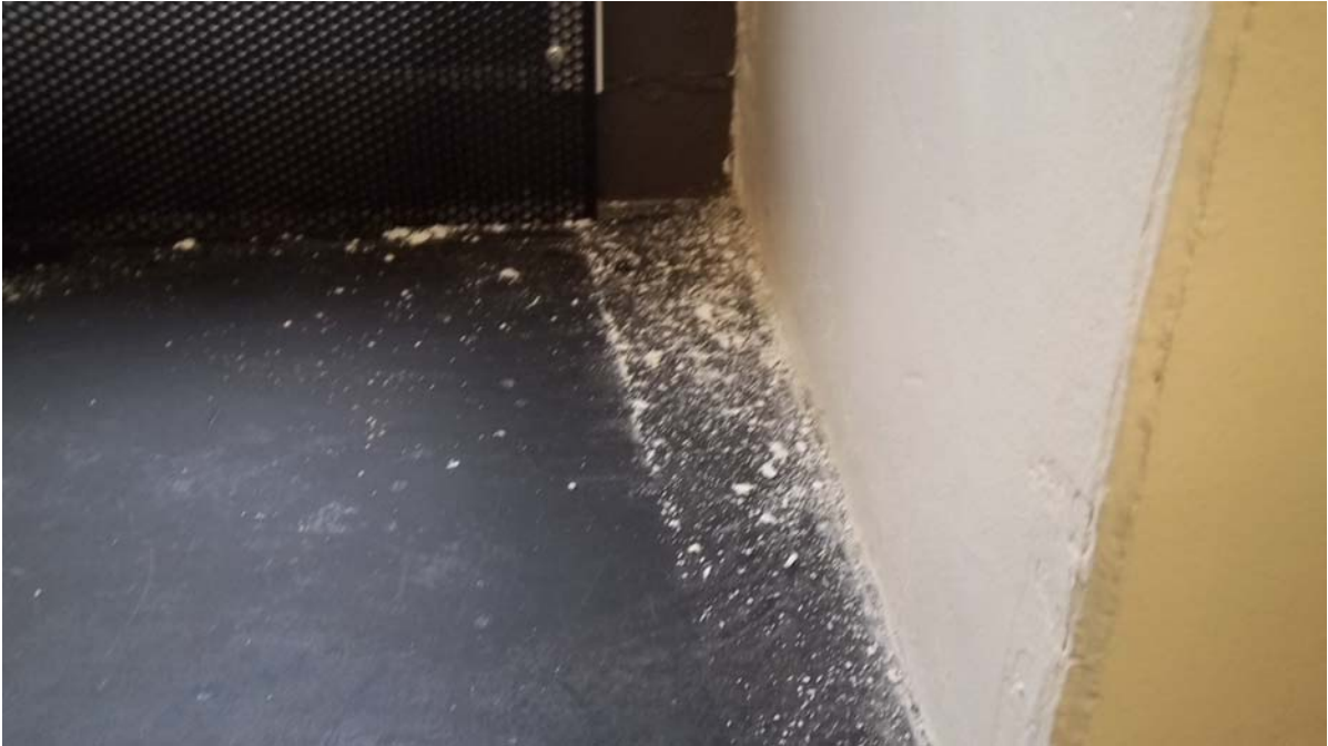
Photo 21 – Room 204 Paint and plaster debris was observed on one of the window sills.