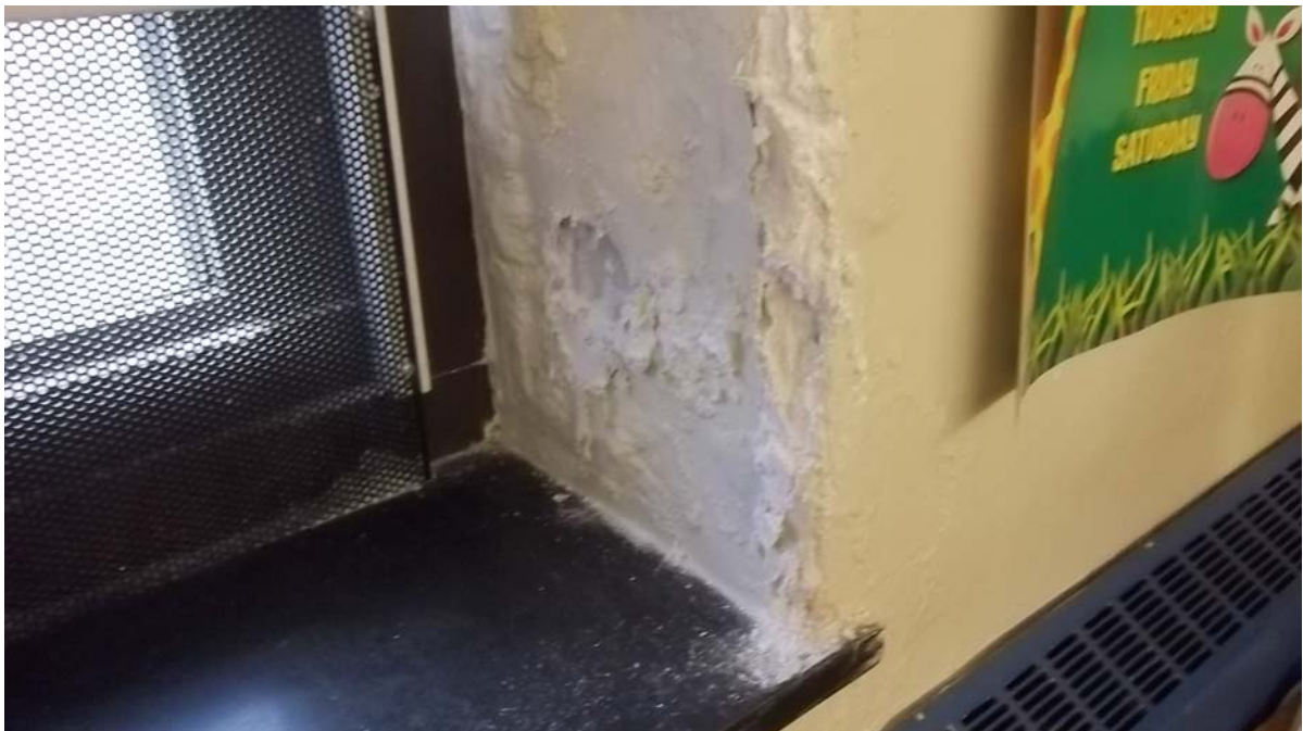
Photo 4 – Room 106 Moisture damaged paint and plaster was observed around the windows.