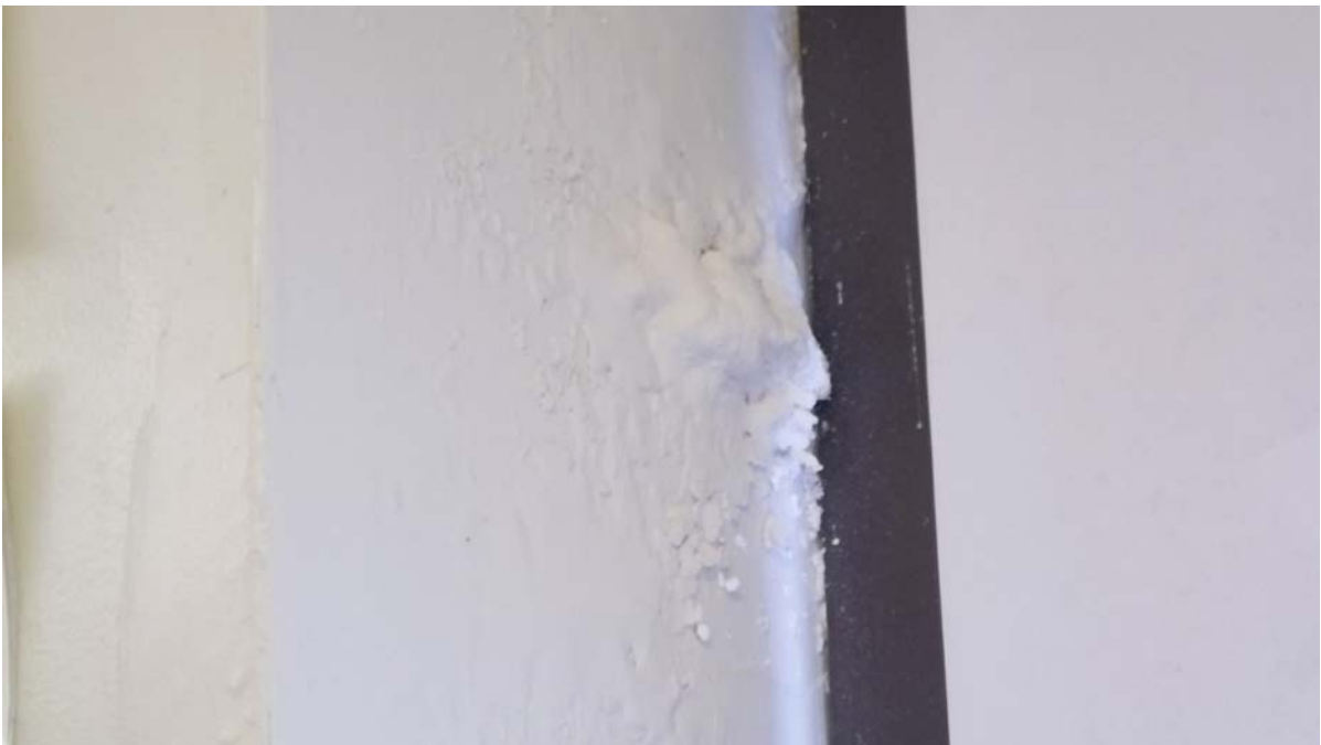
Photo 10 – Room 102 Moisture damaged paint and plaster was observed around 5 windows.