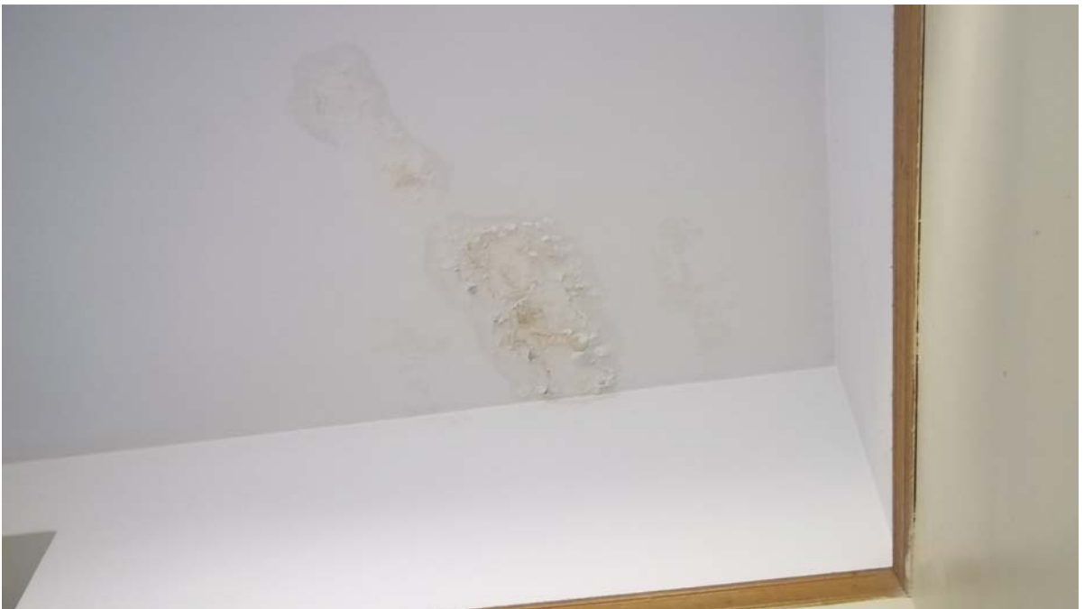
Photo 24 – Room 206 Flaking paint and water staining was observed on the ceiling from a leak that was stabilized.