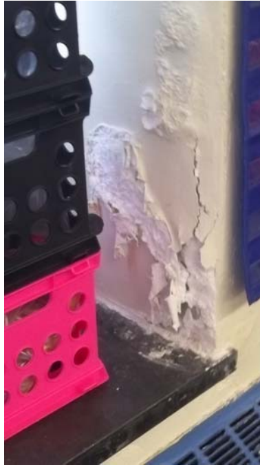
Photo 27 – Room 206 Moisture damaged paint and plaster was observed around 2 windows.