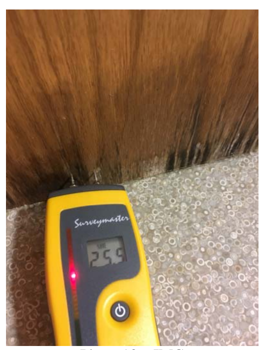
Photo 13 – IMC Elevated moisture content was detected on the work stations below the center supply branch.