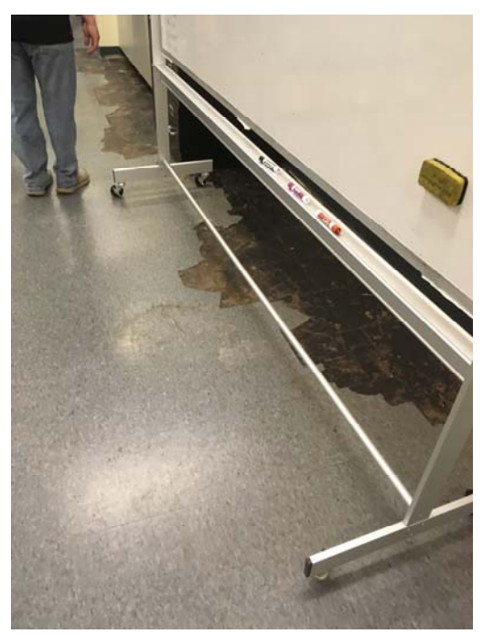
Photo 1 - Room\ 102 A missing section of floor tile was observed in front of the unit ventilator.