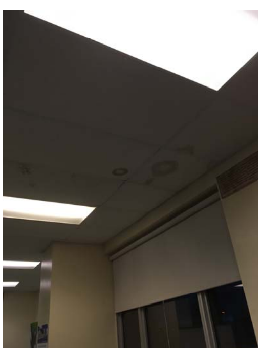
Photo 2 – Room 102 Water stained ceiling tiles were observed above the unit ventilator.