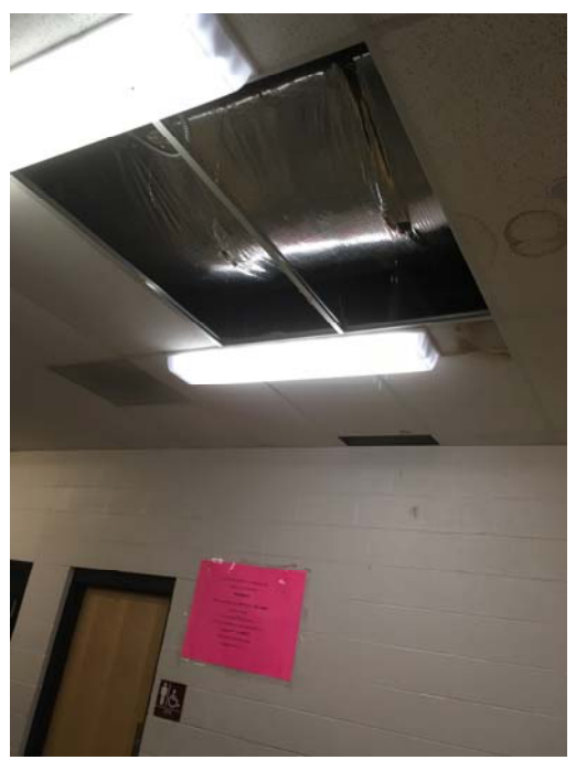
Photo 6 – Hallway outside Room 106 Condensate was leaking from a section of duct work located above the suspended ceiling.