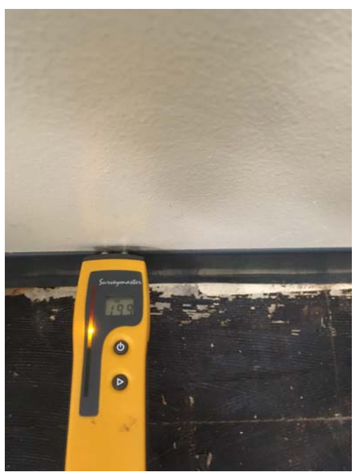
Photo 4 – Room 102 Elevated moisture content was detected on the wallboard below the section of mold growth.