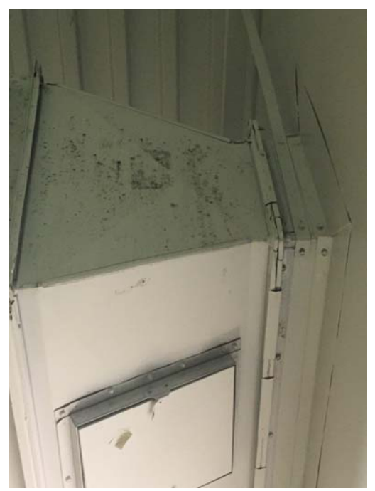
Photo 10 – IMC Mold growth was observed on sections of the exposed duct work.