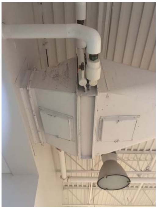
Photo 8 –IMC Mold growth was observed on sections of the exposed duct work.