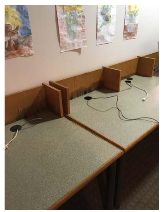
Photo 12 – IMC Suspect mold growth was observed on the work stations below the center supply branch.