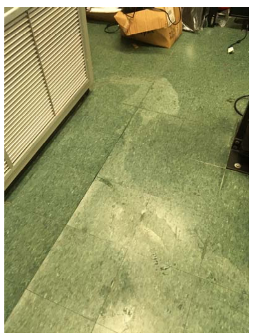
Photo 17 – IMC 134 MDF Room A delaminated section of floor tile was observed from the leaking condensate pump.