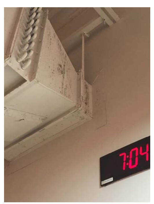
Photo 9 – IMC Mold growth was observed on sections of the exposed duct work.