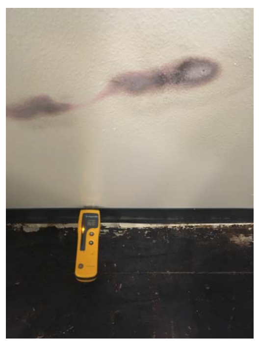
Photo 3 – Room 102 Mold growth was observed on the wallboard to the right of the unit ventilator.