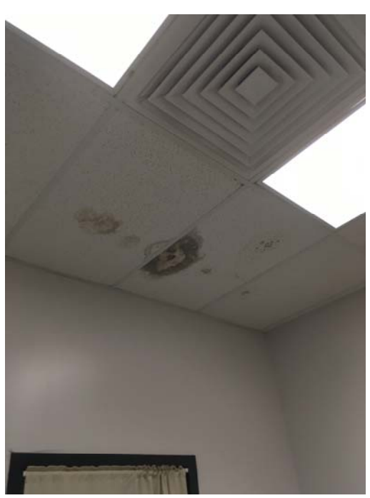
Photo 14 – IMC Office 136 Water stained and moldy ceiling tiles were observed.