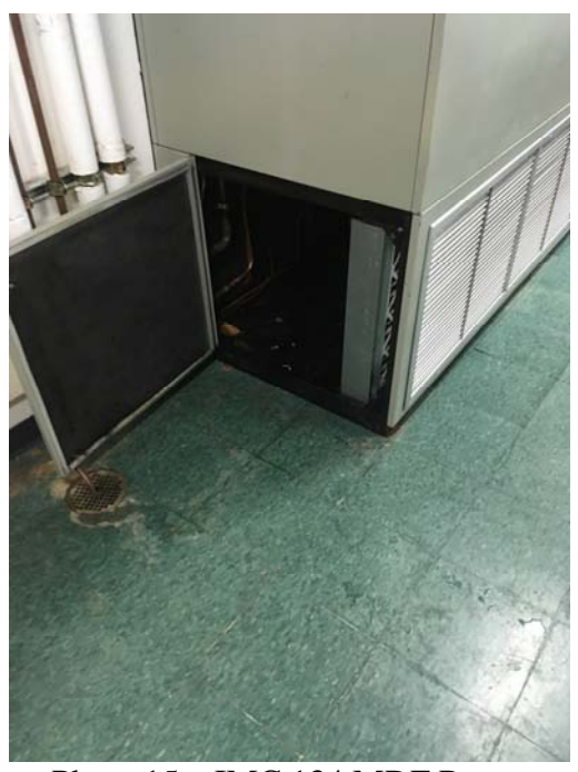
Photo 15 – IMC 134 MDF Room Water was leaking from the condensate pump.