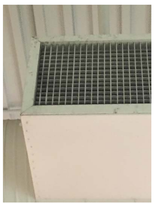
Photo 11– IMC Mold growth was observed on sections of the exposed duct work.